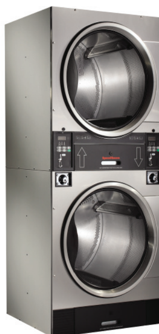
Stainless Steel Front