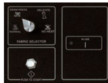
Dryer Slide Operated Control