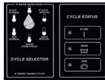
One-Speed Washer Slide Operated Control